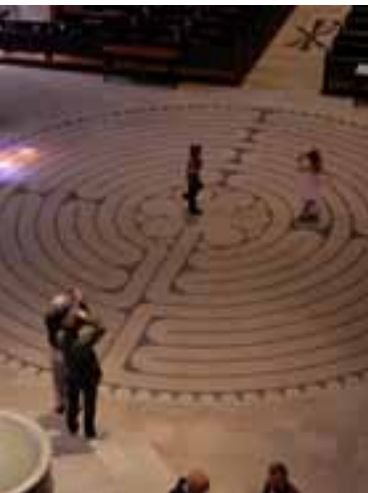
» Chartres Cathedral 13th century labyrinth.