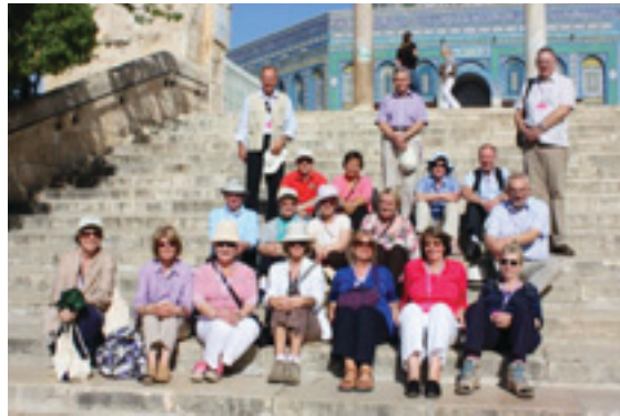
The Pilgrims in Jerusalem

The pilgrimage also involved stops at the Garden Tomb, the Shepherds' Fields and the Church of the Nativity. There was also