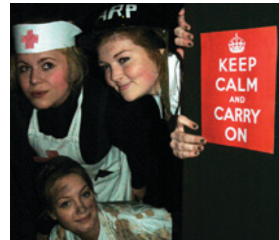
Drama students from Archbishop Blanch perform ‘The Women Left Behind.’

used music and craft to teach the Nativity story.